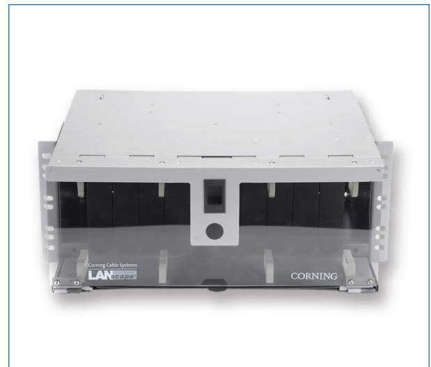
Part Number: PCH-04U